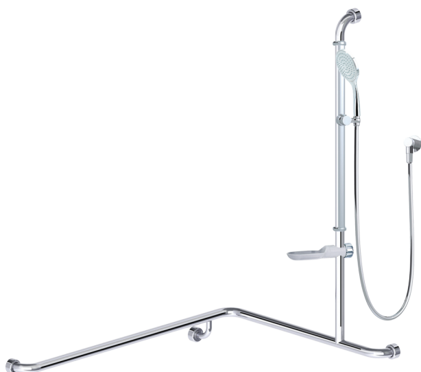
Drawn RH (Right Hand)